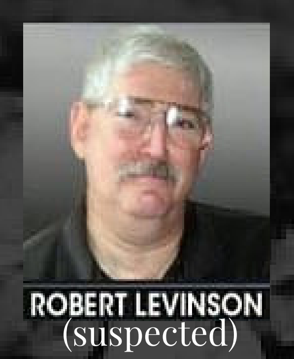
American Hostages Left Behind

Sponsored by Concerned Women for America LAC